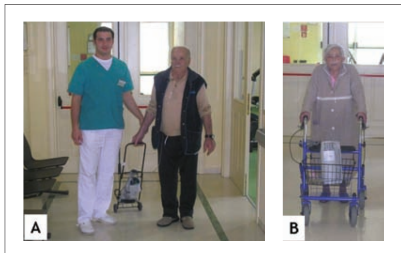
Figure 3. Walking aids for portable liquid oxygen canisters. Oxygen is transported using a small wheeled cart (a) or a rollator (b).

Among the daily activities of CRF patients, travel might represent a further application for AO. Since the oxygen container is transportable, it may be used in the patient's car or on public transport, such as bus, train or airliner. When travelling, the device should remain in an upright position ( i.e. standing up on the back seat with a rear seat belt to hold it in place). Concentrators may also be stowed on buses for interstate journeys; some airlines are able to carry oxygen concentrators free of charge. Nowadays, airlines might provide such equipments and arrange it in order to encourage the lung disease sufferer to travel in any part of the aircraft. In the ►