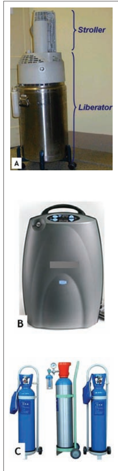
Figure 1. Sources of oxygen systems. a) Liquid oxygen with refillable base ("liberator") and portable canister ("stroller"). b) Oxygen portable concentrator. c) Compressed gas cylinders.

At present, due to the costs and the relatively easier availability (even in small towns) compared with other systems, compressed oxygen cylinders are most widely prescribed for domiciliary or ►